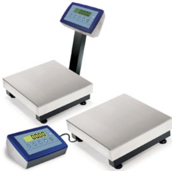
EPQ30 with or without TQNC column